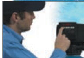
Installing the Fleck 5600 softener system can save significant amounts of water and salt.

The 5600 control valve has been engineered and tested to withstand the equivalent of 27 years of uninterrupted daily use.