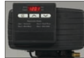
Advanced SE Electronic Timer